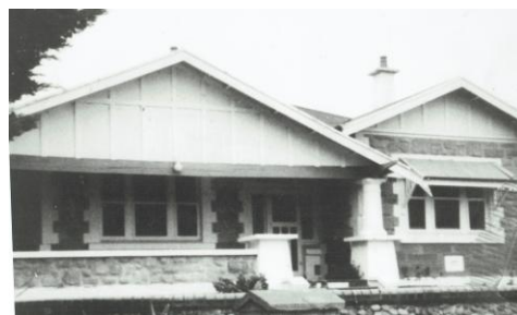
Some of this house in South Street was built from stone formerly from St. Patrick's Undalya church.