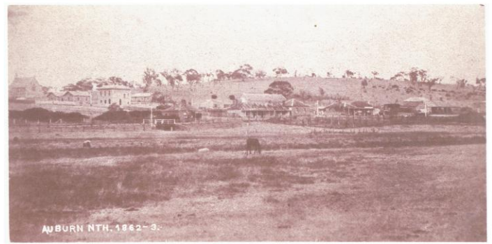
Auburn North, C. 1862