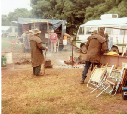
The camp site with fire burning, where the Teamsters and support crew experienced miserable conditions for the few days they were set up in Auburn.