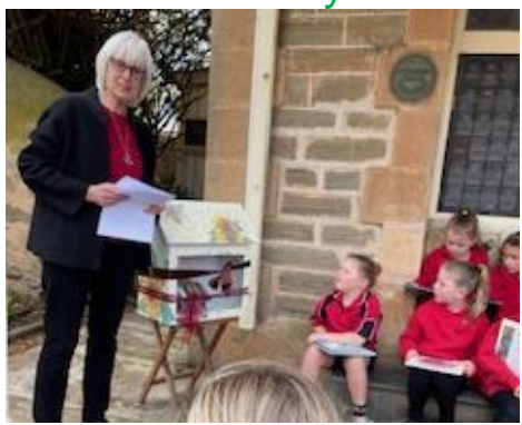
Hellen speaking with students

On a very windy day, 16<sup>th</sup> August, the Auburn Primary School students and staff met with community representatives to hold the official "Opening" of the Little Street Library currently located at the Auburn Post Office.