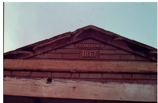
The 1861 shop dressed stone is now stored at the Auburn National Trust