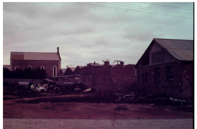
The old solid tyred truck that the wheel came from was at one stage in the foreground of this photo of old metal items. To the right is the Stephens' former large carpenter shop on the corner of South Street and Main North Road. The back views of the 1861 shops facing Main North Road and the then Methodist (now Uniting) Church plus an unused tennis court, filled the space behind the buildings. This view after a fire. In 2023 four houses are on these allotments.