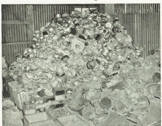
Pots and pans. Aluminium to be converted to the need of war.