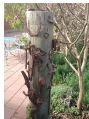
Post with items attached for display found on Auburn foundry site