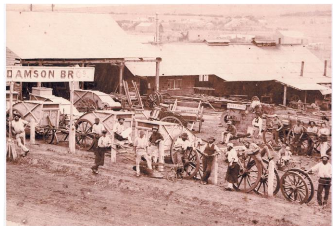
1875 photo of Adamson's Kapunda foundry displaying strippers "Adamson Auburn" on them