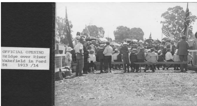
Auburn bridge opening crowd