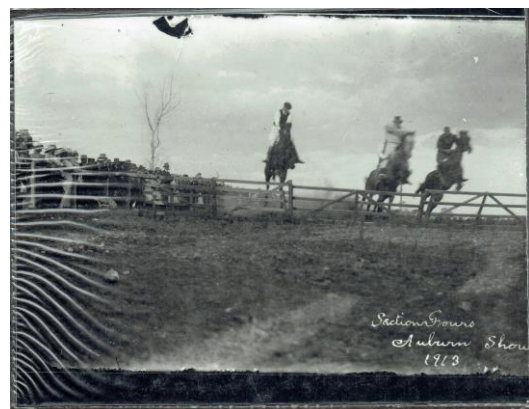
Section four at the Auburn Show 1913. Most likely the young Castine would have attended the shows. Drumcalpyn collection, Auburn National Trust

A recreation park and pavilion were opened in 1910 just north of the current oval. Horse racing was held in Auburn in the 1850's on the river flats and from 1857 the Showground (on the south side of the road just before entering Auburn from Manoora) was used for recreation.