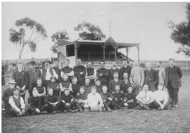
Auburn Football Team 1912