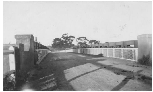
Inside view of bridge which was replaced in 1971

"The town oval was on the other side of the bridge and I well remember the great opening day- flags flying for all the different migrant nationalities."