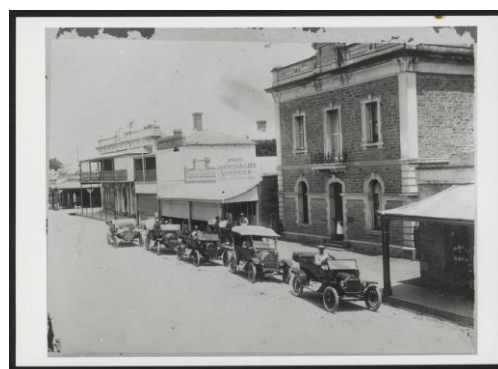
State Library photo B-31057. Cars owned by Bond's Motor Service driven by Bond brothers, Jim, Bert and Eric. They took passengers twice daily to Riverton and back in Model T Ford Tourer cars, the name changed to Bond's motor Tours. Photo in Clare Main Street C.1914

I also remember the first passenger buses at Auburn – Bond's passenger buses. They were Ford cars with an extra seat put on the back and a canopy over the top. They ran from Saddleworth to Clare. ( Later Riverton/Clare ).