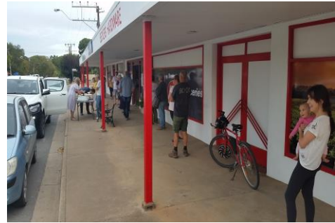
Auburn residents collecting their meals.