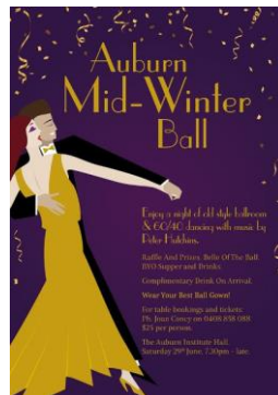
2019 Mid-Winter Ball